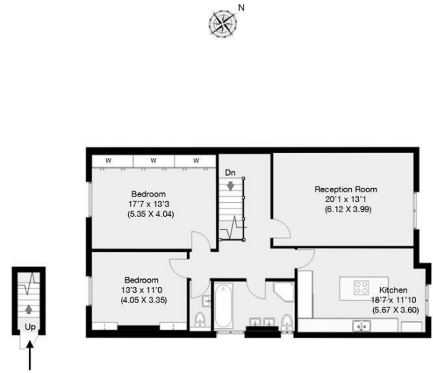
First Floor Second Floor

THIS FLOOR PLAN IS PRODUCED FOR PARKHEATH SUBMITTED BY ARCHIMEDIA web: www.archi-media.co.uk Whilst every attempt has been made to ensure the accuracy of the floor plan contained here, measurements of doors, windows and rooms are approximate and no responsibility is taken for any error, omission or misstatement. These plans are for representation purposes only and should be used as such by any prospective buyer or lease. Specifically no guarantee is given on the gross internal floor area of the property if quoted on this plan and any figures given is initial guidance only and should be treated as such.